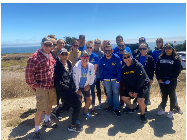
Thank you Santa Cruz Warriors office staff and season ticket holders