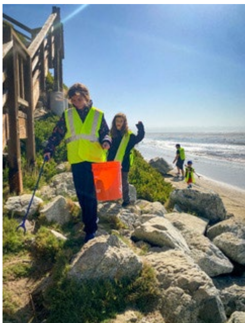
Little Nature Lodge volunteers!